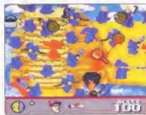
Water Monks vs. Fire Druids